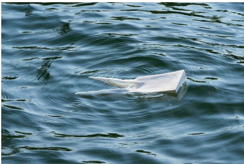
Erdal Bilici, Push&Pull , Tarup-Davinde, 2025

In 2024/25, participants worked in relation to the landscape around Tarup-Davinde, a former gravel quarry. Here, the works unfolded as markings and shifts in the area's complex interaction between geology, industry, biodiversity and community life.