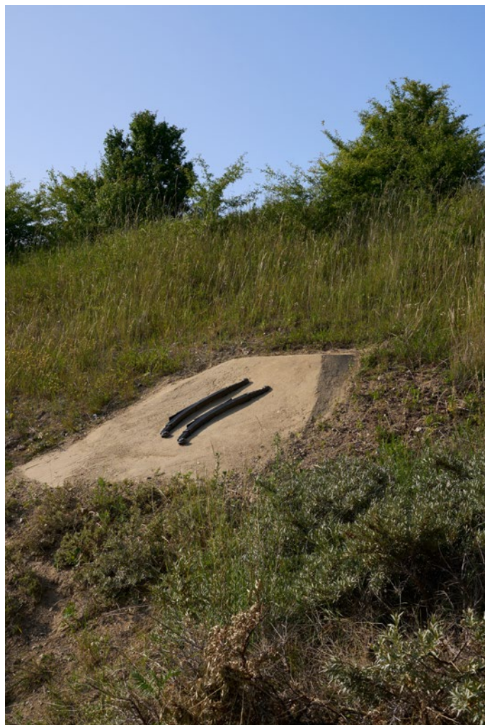
Therese Bülow, Bounce , Tarup Davinde, 2025