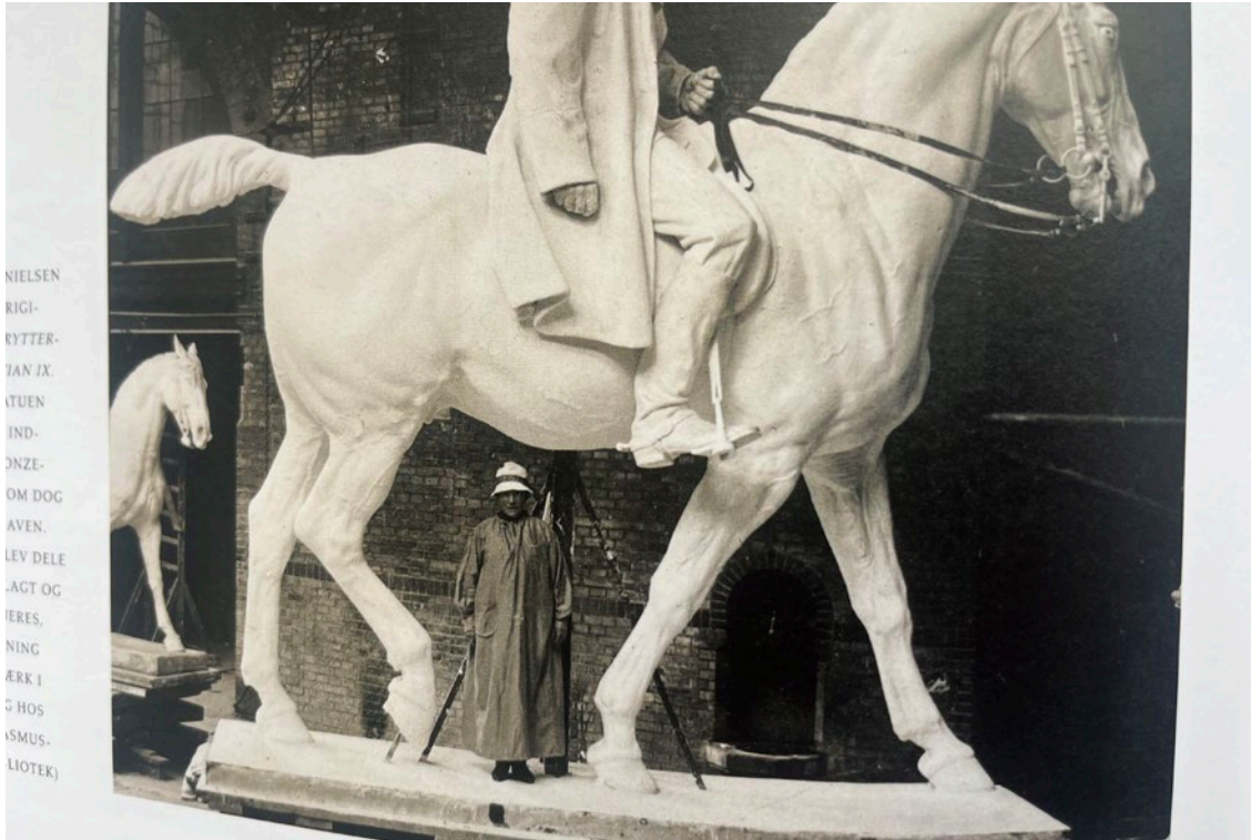
Anne Marie Carl-Nielsen under the plaster model of the Christian IX equestrian statue, 1924